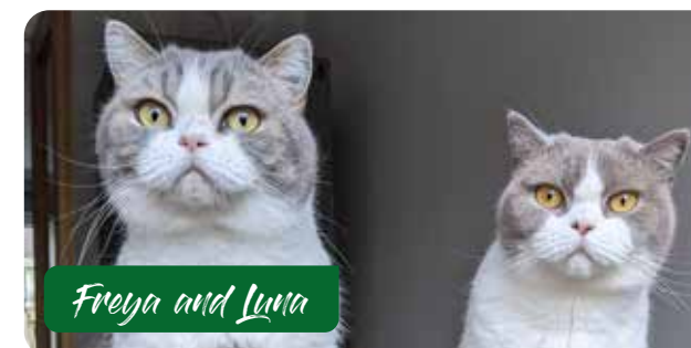
Freya and Luna

Here's an update on Freya and Luna (previously known as April and Esme) who we adopted from Wingletang. Freya and Luna have been the perfect additions to our family and we can't imagine life without them now. The girls love to spend their days watching the world go by from their cat trees or wandering round the garden. They are typical British Shorthairs so they aren't overly bothered about having fuss, but they will allow it on their own terms and we've usually got two